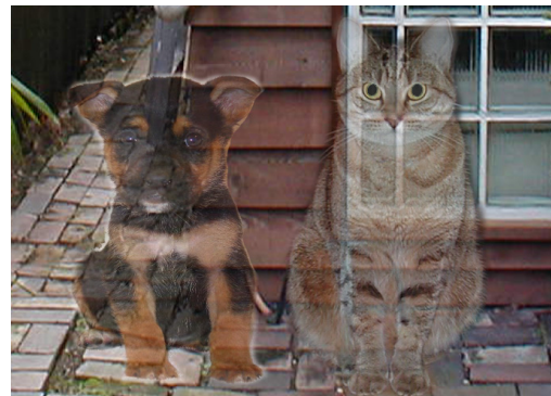
Ghost Pets? Well, they are cheap to feed!