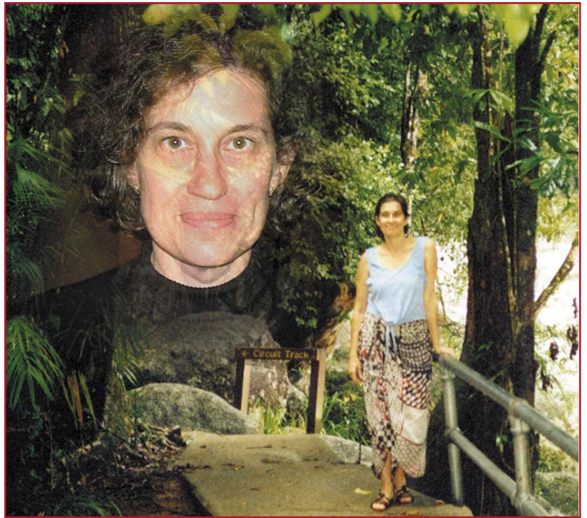
Gorgeous Moss Woman at Mossman Gorge

The haziness of the photo is due to fine mist at Mossman Gorge.