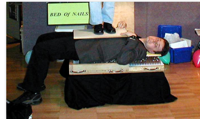
A Bed of Nails is a lot more comfortable than it looks!

The show emphasises the importance of asking questions with time for students and teachers alike to quiz the Mystery Experts on strange events and amazing claims.