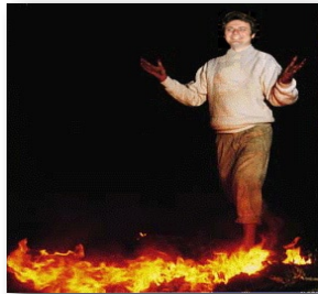
No real pit of fire needed. Our show uses the fire of imagination.